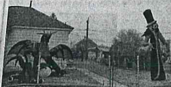
A tall pumpkin in a field and a ghost in a field. Do you know where it is? Give us a tip for a future edition of the Anaconda Leader.