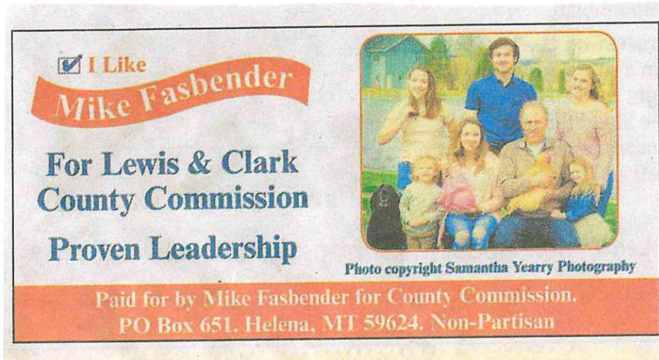
EXHIBIT A (1)

Ad from the Helena Independent Record, 2020 Primary Election Guide, Sunday, May 10, 2020, Page 27: