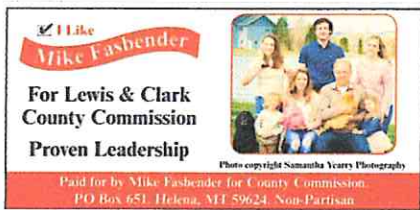
EXHIBIT A (2)