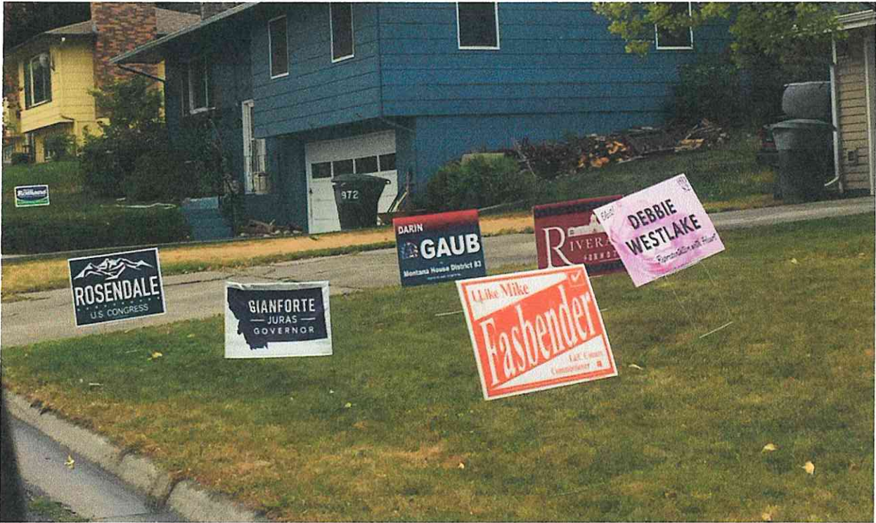
EXHIBIT C (1)