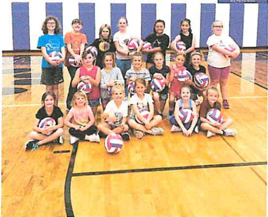
The future generation of Lady Panthers worked hard at kindergarten through fifth grade volleyball camp the last two weeks.