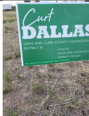
Yard sign located at Dave's Exxon