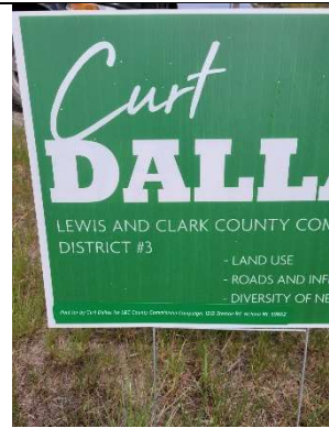
Located on Wylie Drive