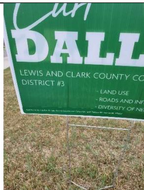
Yard sign located on Brookfield Dr