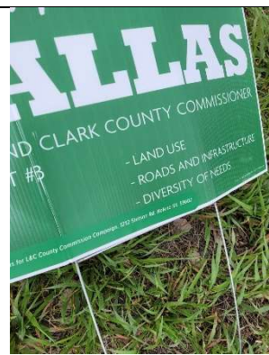
Located on York Road