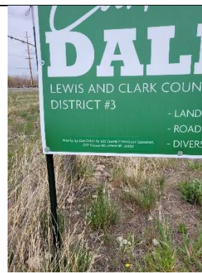
Located on Canyon Ferry Rd