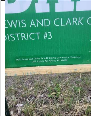
Located at corner of Willow Ave and Green Meadow Dr