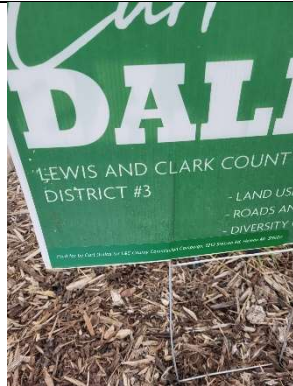
Yard sign located at Dave's Exxon