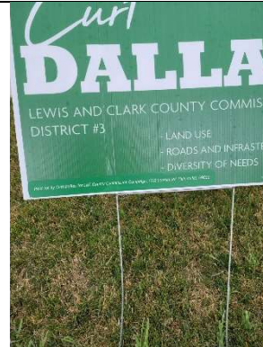
Yard sign located at Dave's Exxon