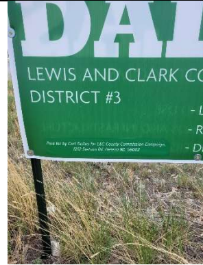
Located on Mill Road