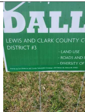
Yard sign located on Brookfield Dr