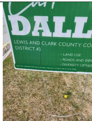
Yard sign located on Brookfield Dr