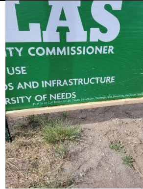
Located on York Road