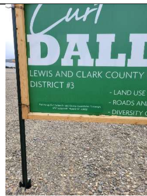
Located on York Road