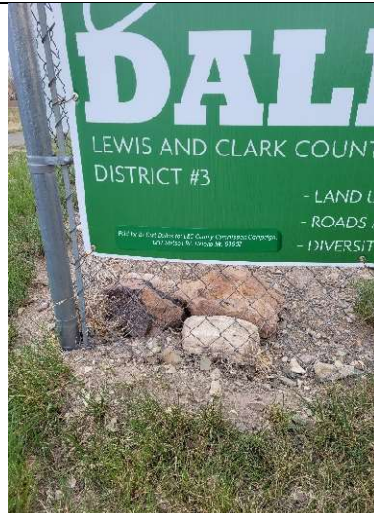
N Montana Ave near West Valley VFD