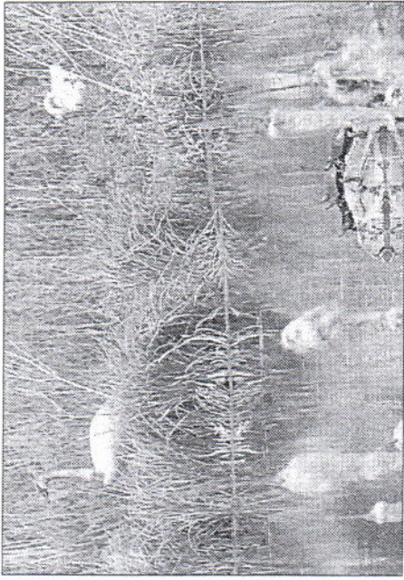
Swans and turtles enjoy the sun at the National Bison Range.

Down by the ponds, the See BISON on Page 11